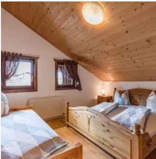
1-7 Personen · 2 Bedrooms

The apartment comprises a large, cosy kitchen which is the heart of the flat. From there you have access to two bedrooms with 3 beds each, the bathroom and the living room with a bedsofa.