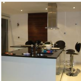
2-7 Personen · 3 Bedrooms

A large 3 bedroom luxury family ground floor apartment for cozy nights in front of the fireplace, with power showers and underfloor heating. Beautiful views ! This price is includes electricity,