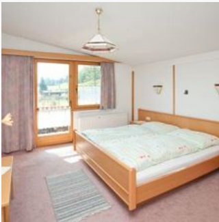
1-60 Personen · 1 Bedrooms