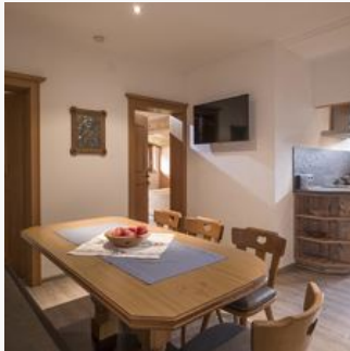
1-6 Personen · 3 Bedrooms · 120 m 2