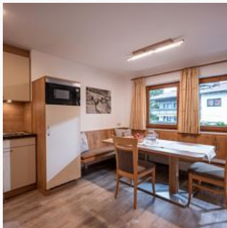
2-7 Personen · 2 Bedrooms · 75 m 2

- 75 m 2 for 4-7 persons - 2 bedrooms - 2 bathrooms with shower - living room & kitchen with dining area and sofa bed - 2 Flat-TV, radio, safe - free WiFi - large balcony