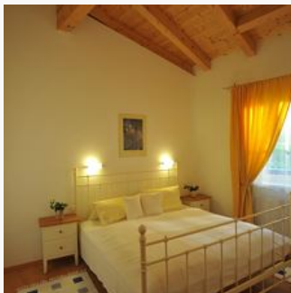
1-2 Personen · 1 Bedrooms

Enjoy a pleasant stay at our omfortably furnished apartment with its big hall, one bedroom, a living room with a kitchenette, bathroom and separate toilet.